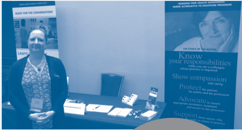
Colorado Nurses Association Exhibit

PAS contracts with the Colorado Department of Regulatory Agencies for these programs, which are funded through license fees.