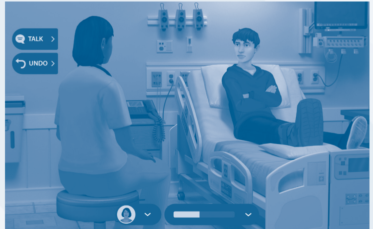
Online training module

Anticipating the conclusion of SAMHSA funding in February 2017, PAS bid on and was awarded a contract with the Colorado Department of Health Care Policy and Financing to provide SBIRT training and technical assistance to health professionals. Services began in March 2017. The program provides in-person training for health professionals in each Regional Care Collaborative Organization (RCCO) region; easily accessible online interactive SBIRT training that provides continuing education credits for physicians, nurses, and social workers; technical assistance to support SBIRT implementation; development of a public awareness campaign to reduce stigma and increase help-seeking; and continued collaboration with other organizations and initiatives to promote routine early intervention to address alcohol and other substance misuse in adults and adolescents.